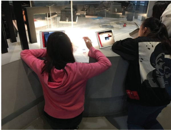
Figure 2. Students in the experiment group who used iPad to access AR.

Figure 2 shows a picture of the students in the experiment group using AR to complete their worksheets. Students in the control group were only given the worksheet to explore the different exhibits ( Figure 3 ).