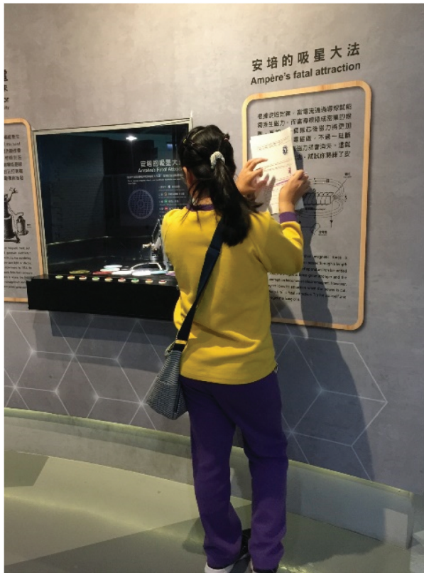
Figure 3. Students in the control group exploring museum with provided worksheet.